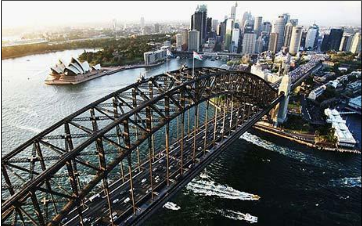
Sydney Harbour Bridge, Sydney, Australia