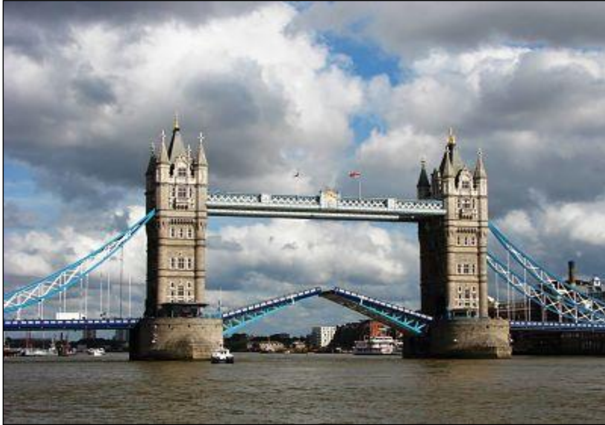
Tower Bridge, London