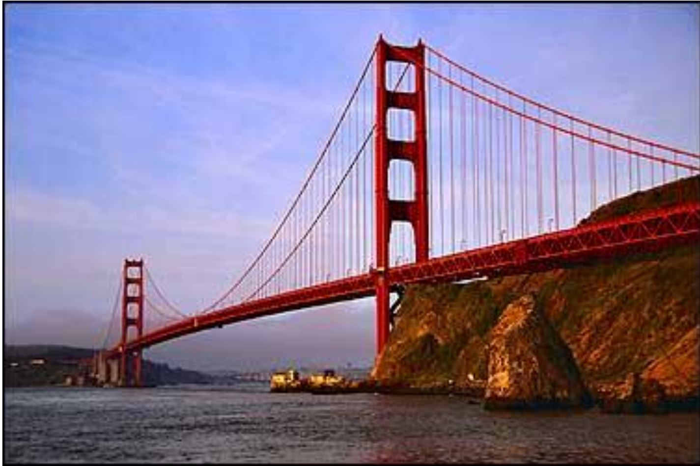
Golden Gate Bridge, San Francisco, USA