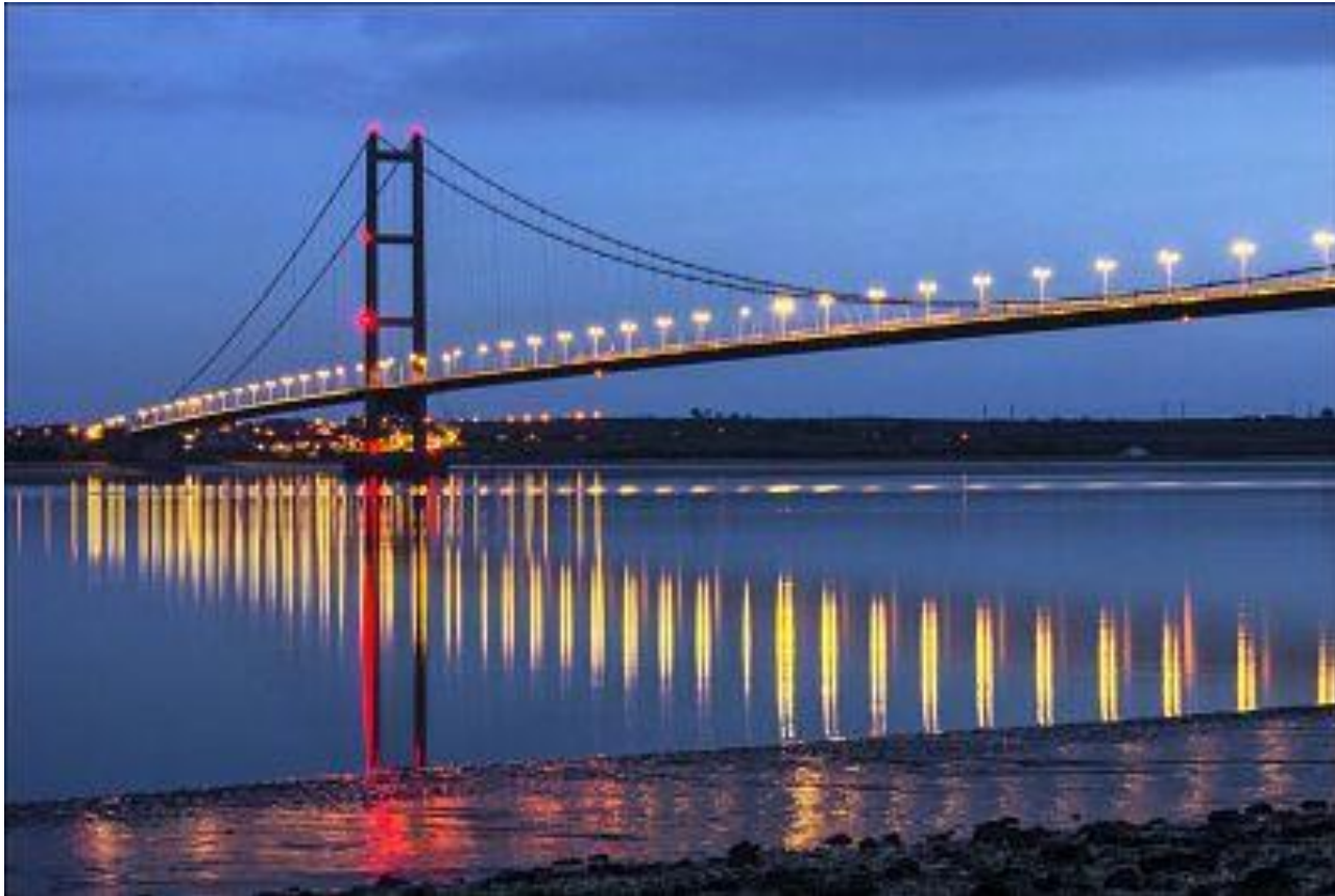
The Humber Bridge, Hull