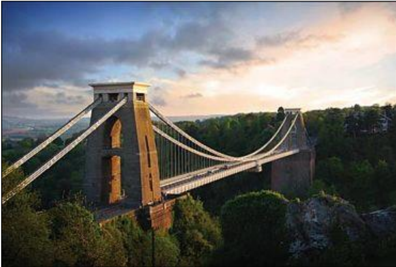
Clifton Suspension Bridge, Bristol