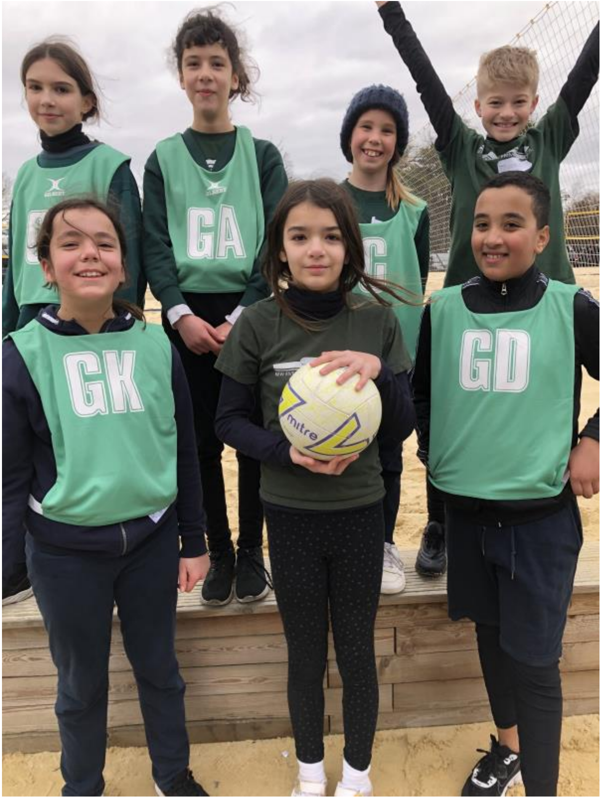
Kew Riverside Primary Newsletter