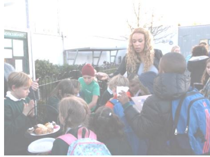
Running the cake sale