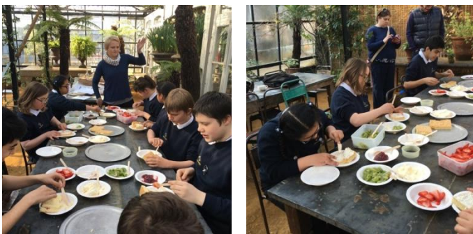
Clarendon School students building their yummy sponge cakes at the Petersham Nurseries tea house

Please say "Thank You" to Petersham Nurseries for their support of the Centre by visiting them and their marvellous restaurant and, of course, the nursery itself. http://petershamnurseries.com/