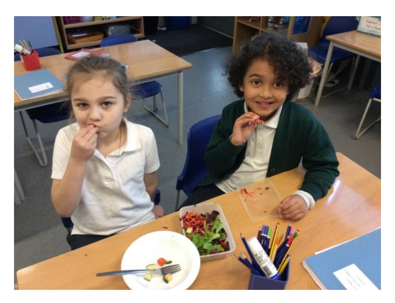
Kew Riverside Primary School Newsletter