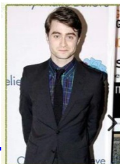
I'm an atheist, but I'm very relaxed about it. I don't preach my atheism.